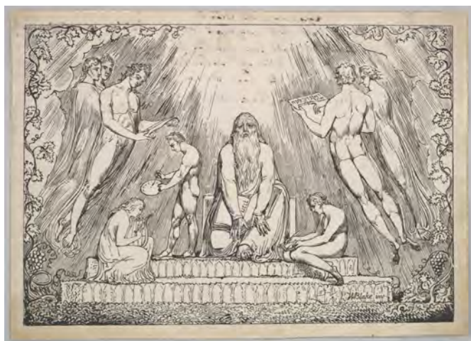
Figure 1. In this lithograph, Enoch is honored as he takes a position on a raised dais. Reputed in Jewish tradition to have invented writing, Enoch holds a book containing Hebrew letters. Angelic beings on each side represent the gifts of prophecy and inspiration. 56

Consistent both with the teachings of Moses 6:57 and Nickelsburg and VanderKam's conclusions that the various titles mentioned in the Similitudes refer to a single individual, James Waddell argued not only that the "five specific epithets . . . refer to the same messiah figure" 54 but also, significantly, that the "author(s) of the [book] understood the messiah figure to be distinct from the divine figure who is the one God." 55