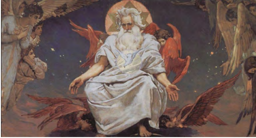
Figure 3. Viktor Vanetzov (1848–1926), God of Hosts , 1885–96. 141

and the apocryphal record ascribed to Adam's son, Seth. Thus, the circle is completed. Man of Holiness, the father of the Son of Man in the Adam text, is given a similar name in both pre-Christian and early Christian documents that remained totally unknown to the modern world until their discovery in Upper Egypt and subsequent translation. 140